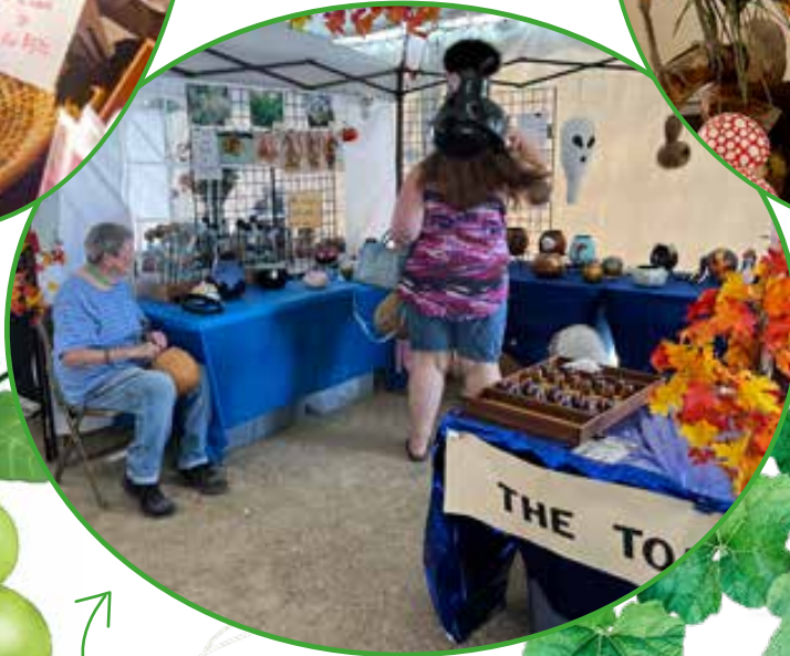
The Tole Shed