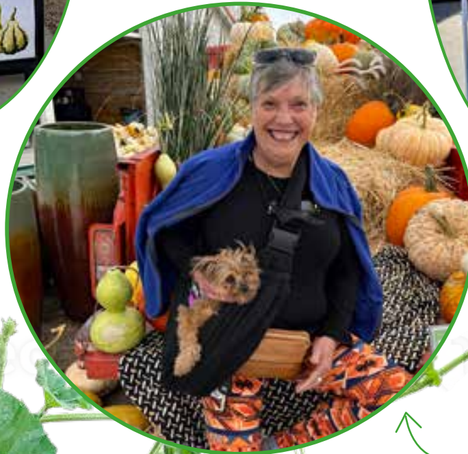
Visitor and her Pup-in-a-Handbag